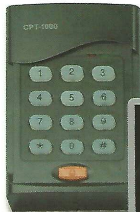
CPT 1000 READER